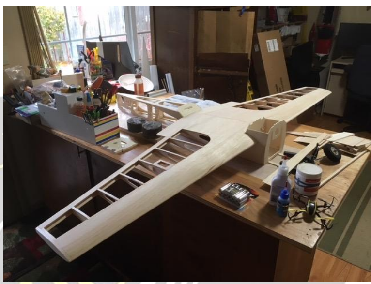
Jeff Lutz's Extra 300