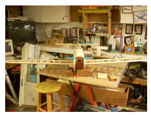
Chick Fosters HOG